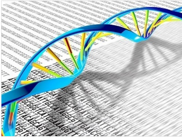
Forensic DNA Analysis »